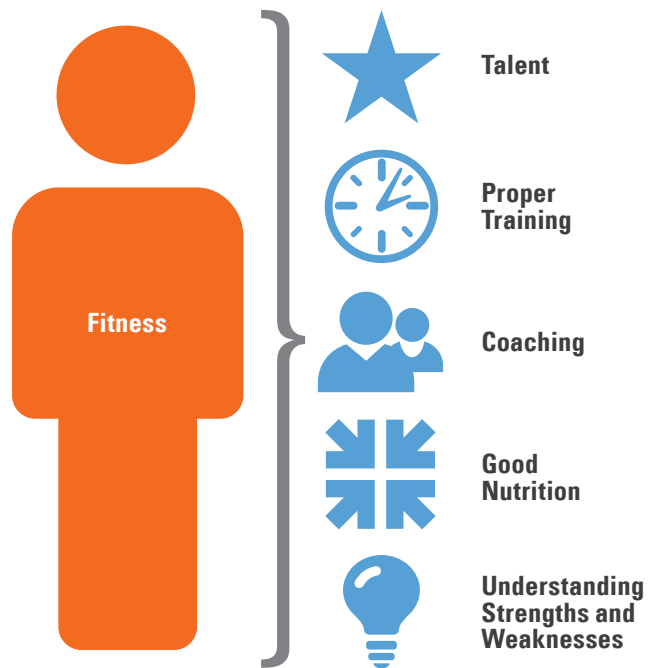
Figure 1: Fit to Win Framework

The competition in the mobile marathon will be fierce and the course will be long with many twists and turns along the way. Not all marathon runners set out to win, but virtually all strive to achieve a “personal best.” This is the recommendation for financial institutions entering the mobile marathon–define what winning means for their organizations, decide what a “personal best” looks like and pick the course that is most likely to help them reach their goal. Here are some things financial institutions should consider when mapping the mobile banking route: