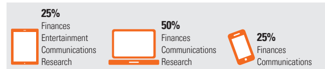
Figure 2: Financial Optimizer Channel Use

On the other hand, ‘The Committed Rebuilder’ (characterised by a financial setback, increased debt and a desire to get back on track) tends to spend the bulk of their technology time on a computer for work and finances even though they are highly engaged with mobile technology for several tasks like scheduling, emailing and task management. Banks and credit unions can use this information to focus their mobile banking investments on the segments that will benefit the most from mobile banking. Similarly, messaging used in promotional and adoption marketing campaigns